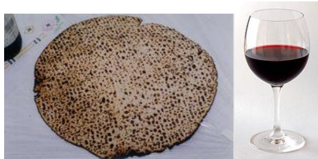
Unleavened bread and wine

As many are aware, the children of Israel were specifically told to observe the Passover in the Old Testament Book of Exodus.