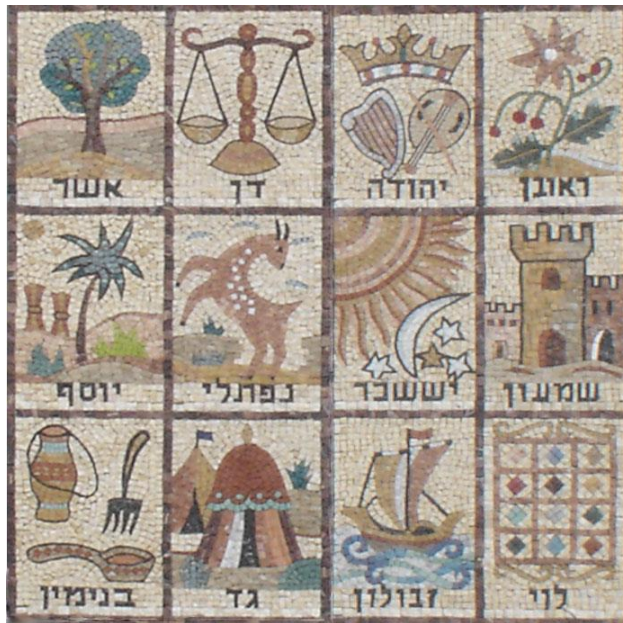
Mosaic of the 12 Tribes of Israel. From Givat Mordechai Etz Yosef synagogue facade, Ha Rav Gold street, in Jerusalem. Top row, right to left: Asher, Dan, Judah, Reuben; Middle: Joseph, Naphtali, Issachar, Simeon; Bottom: Benjamin, Gad, Zebulun, Levi.