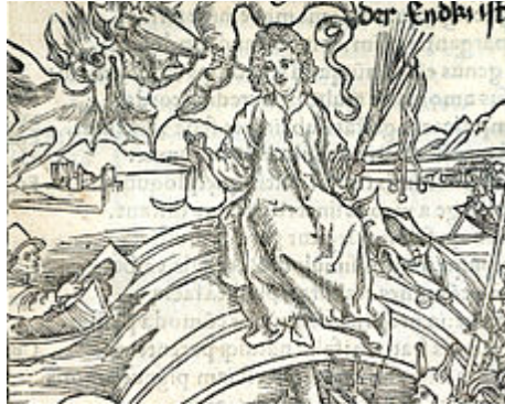
German artist's rendition of the man of sin, 1498