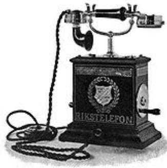
1896 telephone from Sweden