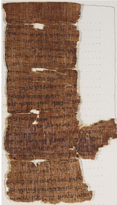
Version of the Ten Commandments in Hebrew