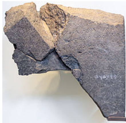
Tel Dan Stela