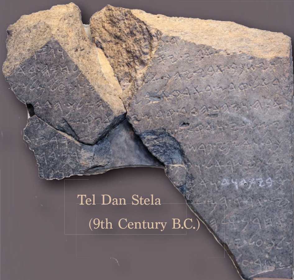
Tel Dan Stela (9th Century B.C.)

Who is the Man of Sin of 2 Thessalonians?