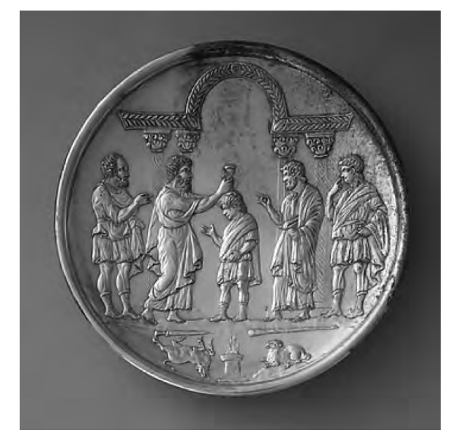
A.D. 629 artist's representation of David being anointed.