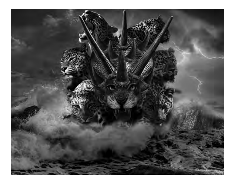
10-Horned Beast of Revelation 13