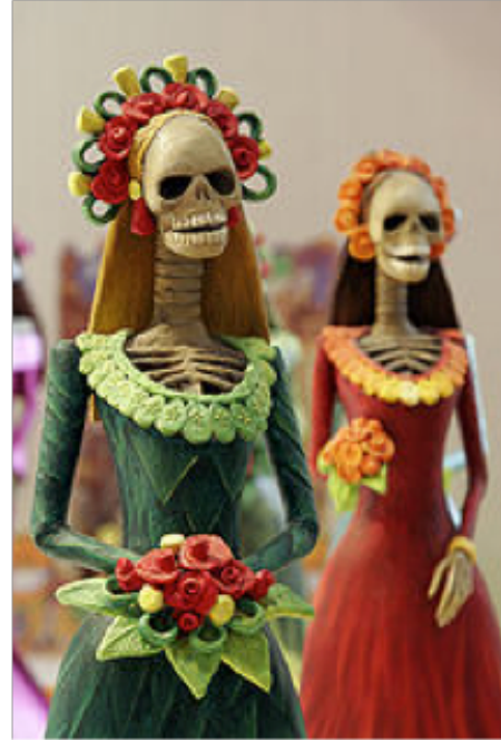
Catrinatas, such as the above, are among the most popular figures of the Day of the Dead celebrations in Mexico (Tomascastelazo).