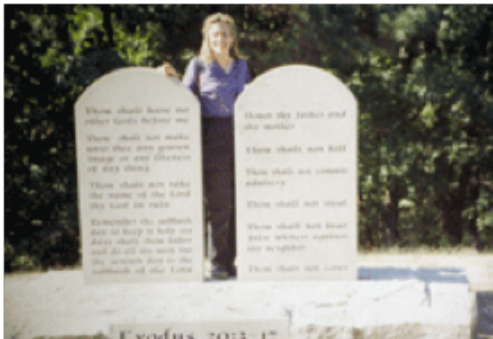
Ten Commandments, Arkansas, 1998

Are the Ten Commandments some type of horrible burden? Some seem to think so, but what does the Bible say?