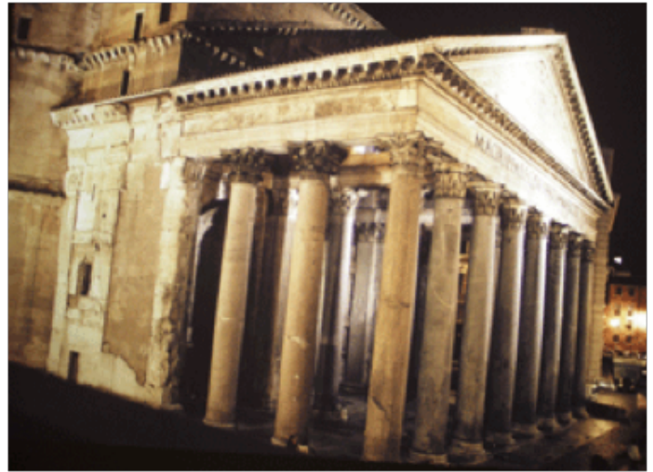
Pantheon of Rome: A Symbol of Unity Among Confusion

The Pantheon was originally a pagan shrine for multiple gods and was turned into a Catholic shrine for multiple "saints."