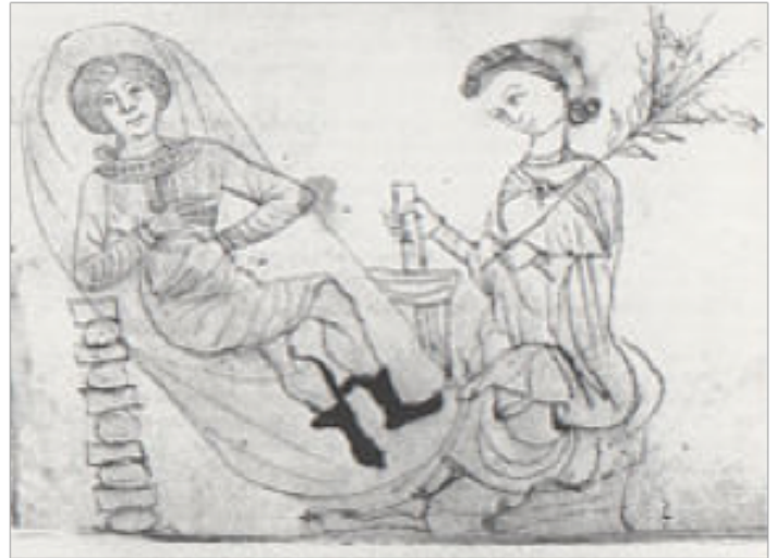
Medieval Abortion Drug Being Given