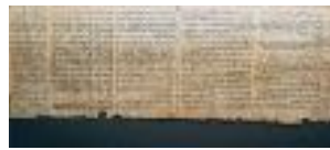
Great Isaiah Scroll