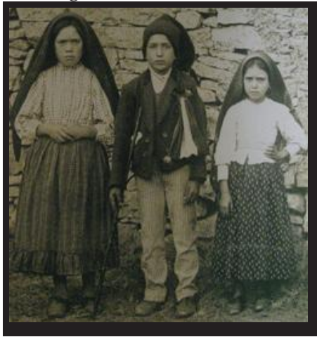
The Three Shepherds, 1917 (Taken in Fatima, 2011)

The generally-related story of Fatima is that three innocent children were blessed to see an apparition who gave “secret” messages. 17