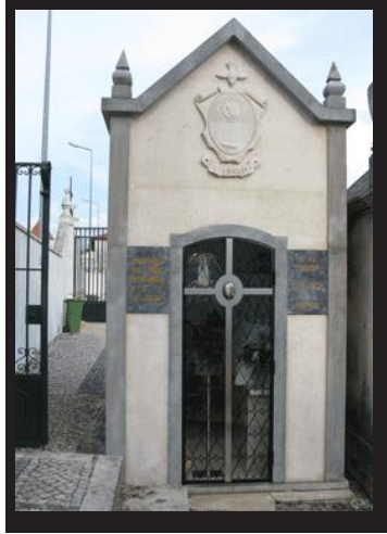
Mausoleum of Canon Formigão (2011)

Notice the dress standard that certain Catholic Fatimist priests have endorsed: