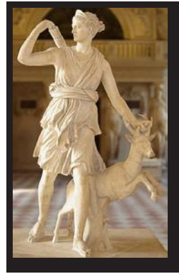
Statue of Diana the Huntress. Given to French King Henry II By Pope Paul IV in 1556. 50

Of course, Diana the huntress is often featured carrying a bow. 51 And while the Lady of Fatima apparently did not display a bow, she could perhaps be considered one, like the Antichrist in Revelation 6:2 (who is shown in vision with a bow), who will try to conquer through messages that resemble parts of Christianity, but are improperly changed (cf. Galatians 1:6-8).