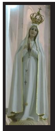
Fatima Basilica Statue