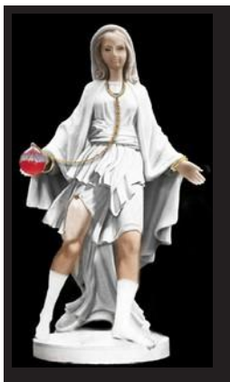
Description of Witnesses