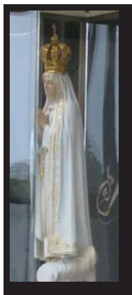
Fatima Capelinha Statue

Based upon the general consensus that Mary would have not violated cultural norms for modesty in 1917 Portugal (cf. 1 Timothy 2:9), which of the following could not possibly be the Mary of the Bible?