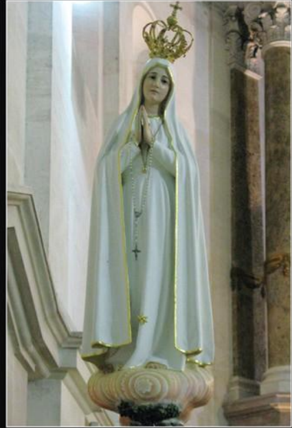
Fatima Basilica Statue

In 1917, three young children saw a series of monthly apparitions that changed their lives as well as the area they grew up in. Few know what the children originally claimed they saw. What they saw and the ramifications of parts of the messages of Fatima will come as a shock to most people. The ramifications of Fatima will affect you, whether you are Catholic or not.