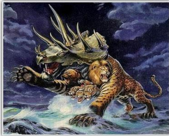
Radio Church of God portrayal of the Beast of the Sea (Revelation 13)

While many claim to keep the Ten Commandments, because of "traditions of men," misunderstanding scriptures, and following improper teachings (cf. Matthew 15:1-9), almost none who claim to be Christian truly strive to properly keep them.