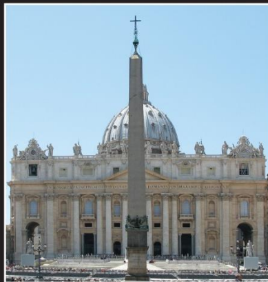
Church of Rome