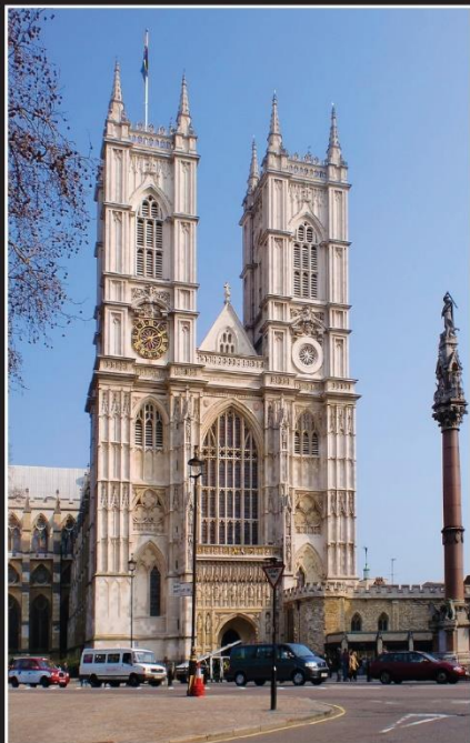
Church of England

18 proofs, clues, and signs to identify the true vs. false Christian church. Plus 7 proofs, clues, and signs to help identify Laodicean churches.