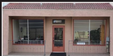
Continuing Church of God

Jesus said that His church would continue (Matthew 16:18)