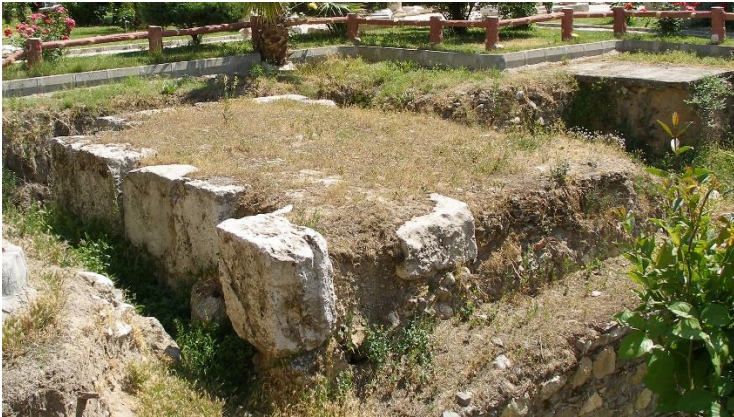
Remnants of Ancient Philadelphia

The second and third chapters of the Book of Revelation contain messages from Jesus Christ for seven churches. Many believe that these churches represent the church throughout the entire church age (from the Day of Pentecost in Acts 2 until the return of Jesus Christ).