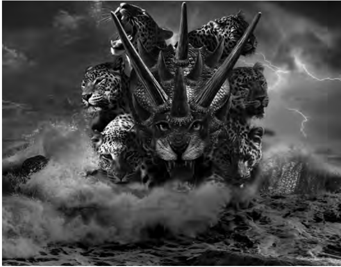
10-Horned Beast of Revelation 13