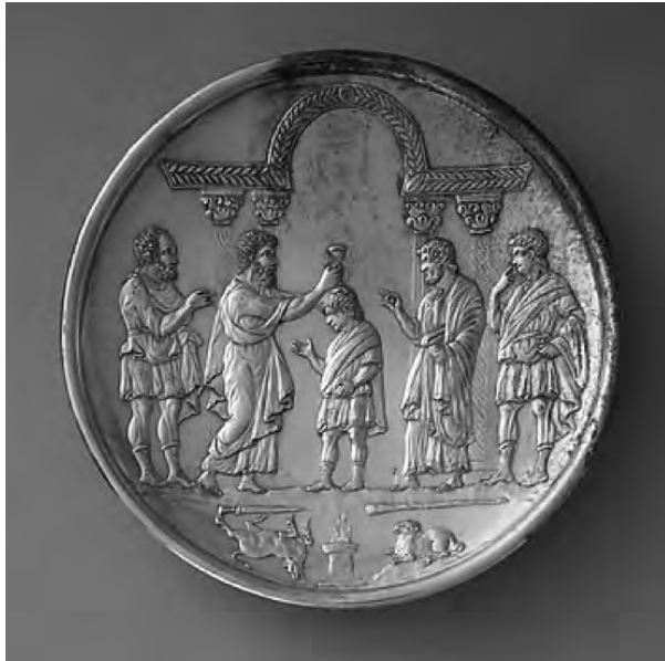
A.D. 629 artist's representation of David being anointed.