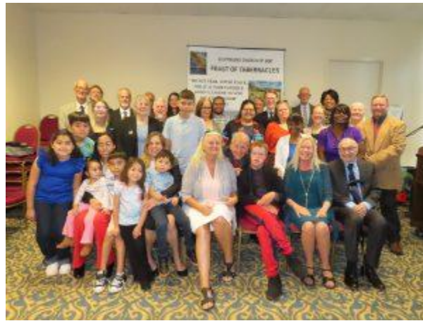
Feast of Tabernacles 2024 Galveston, Texas