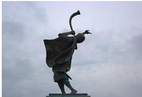
Blowing of a Shofar

The Fall Holy Day season commences with the Feast of Trumpets which begins at sunset September 22 nd and runs through sunset September 23 rd in 2025. Nine days later is the Day of Atonement and five days later begins the Feast of Tabernacles, immediately followed by the Last Great Day which ends at sunset on the 14 th of October 2025.