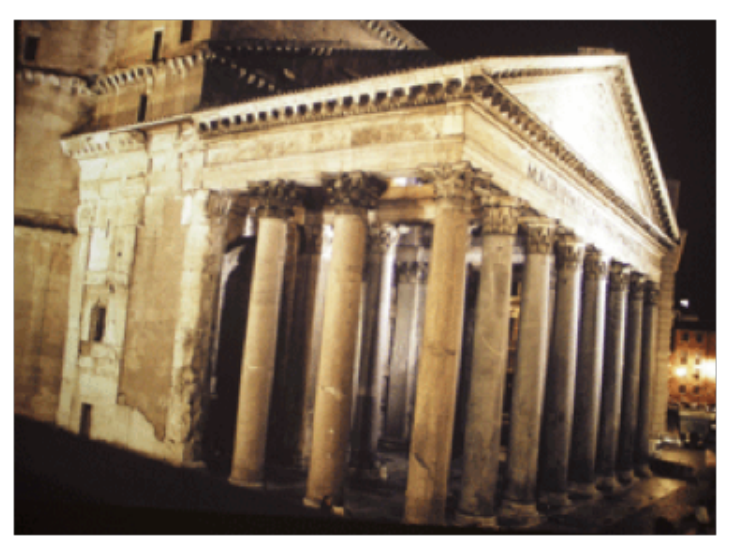
Pantheon of Rome: A Symbol of Unity Among Confusion

The Pantheon was originally a pagan shrine for multiple gods and was turned into a Catholic shrine for multiple "saints."