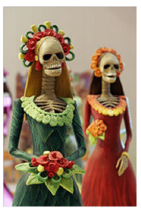
Catrinas, such as the above, are among the most popular figures of the Day of the Dead celebrations in Mexico (Tomascastelazo).