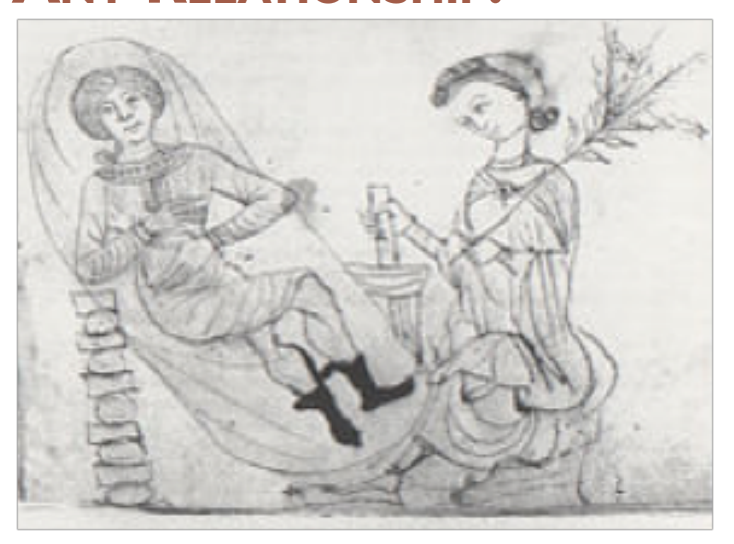
Medieval Abortion Drug Being Given