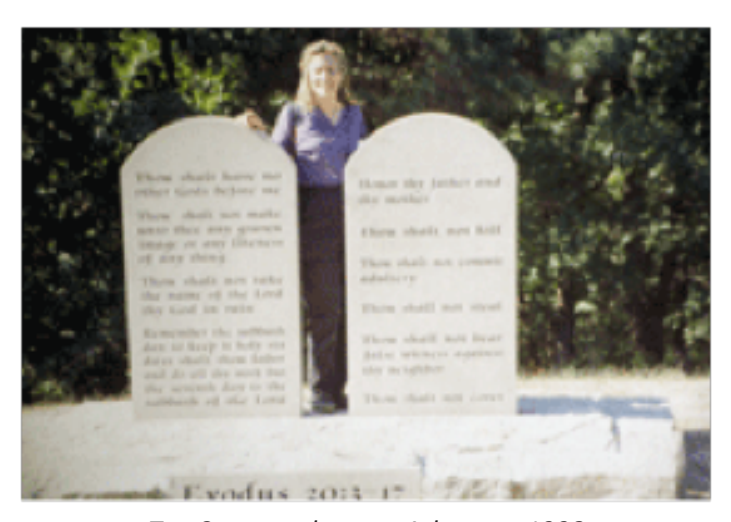
Ten Commandments, Arkansas, 1998

Are the Ten Commandments some type of horrible burden? Some seem to think so, but what does the Bible say?