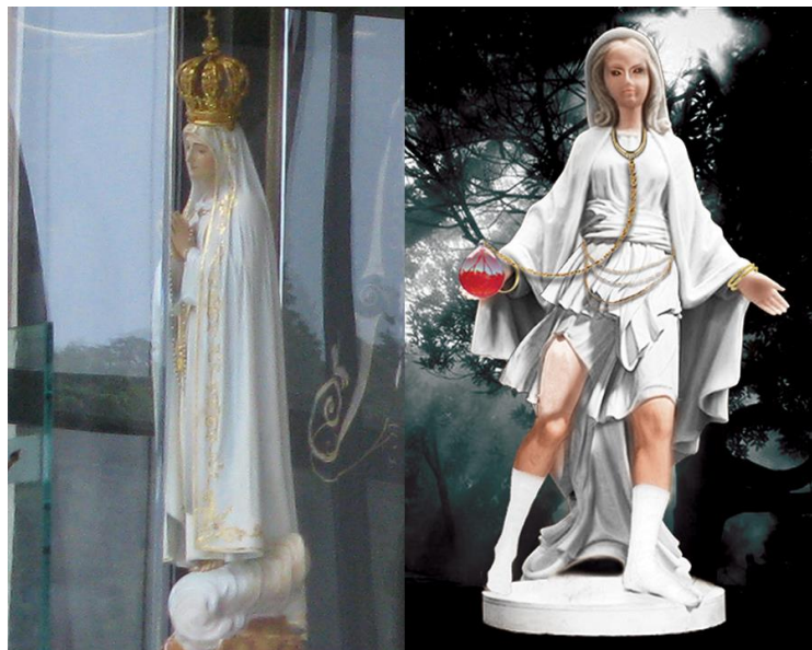
Fatima Statue and Image of What the Children Saw in 1917

Could the apparition at Fatima possibly be Mary or Muhammad's daughter?