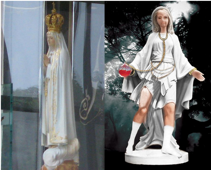
Fatima Statue and Image of What the Children Saw in 1917

Could the apparition at Fatima possibly be Mary or Muhammad's daughter?