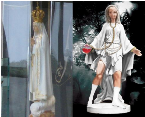
Fatima Statue and Image of What the Children Saw in 1917

Could the apparition at Fatima possibly be Mary or Muhammad's daughter?