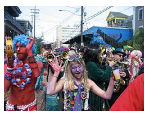
New Orleans Mardi Gras