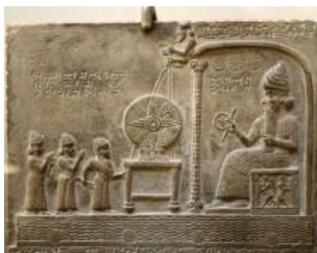
Priests praying before sun symbol and Shamash.

Yet nowhere in the Bible is there any mention of Christians holding the hands with palms together with the fingers pointed upward as is shown on so many religious pictures or artifacts, like one for the prayed Babylonian priests praying to the sun god Shamash around 888 B.C.