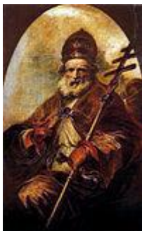
Pope Leo I (Reigned 440-461)