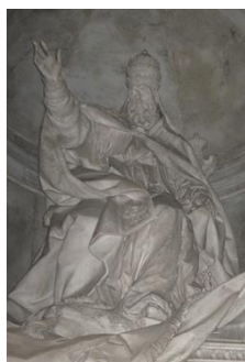
Pope Gregory 13 (Reigned 1572-1585)

passages of the Bible such as those in 1 Corinthians 11 literally. But you and he should.