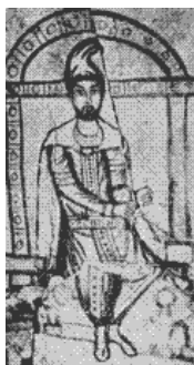
Priest of Mithras (3 rd Century)