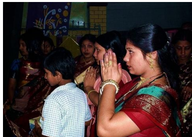
Hindus praying to goddess Durga

Hindus, Buddhists, Muslims, and others follow practices similar to the ancient Babylonians. Since God does not want to be worshiped as the pagan gods were worshiped (Deuteronomy 12:29-31), clasped hands would not seem to be appropriate for Christians.